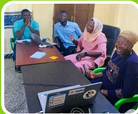
Plate 10.13: FFID staff at the training session