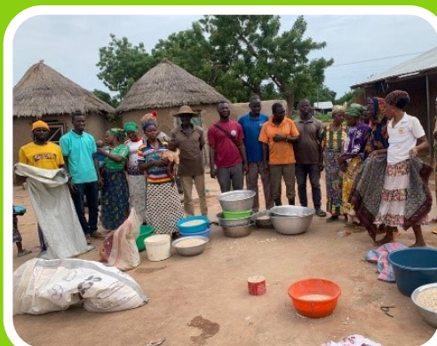
Plate 1.8 Distribution of seeds to farmers at Zuo