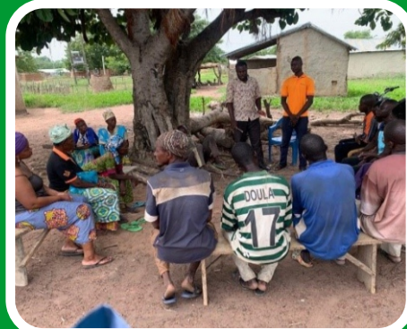
Plate 1.6: Sensitisation of Farmers at Zoa