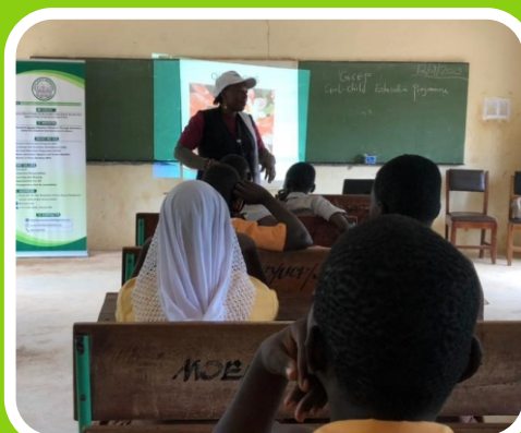
Plate 10.15: Sensitization on mensural hygiene to students at Zugu DA JHS