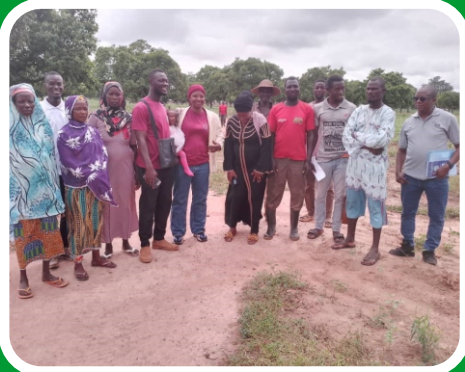
Plate: 10.5: VVF RPD, Staff of FFID and Farmers at Zuo

consider setting-up demonstration farms to promote the SA practices started.