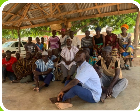
Plate 1.3: Meeting with stakeholders at the Yama

cooperate and work with the organisation in achieving mutually beneficial goals.