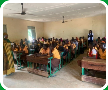
Plate10.11 Executive Director sensitizing students of Zugu on Girl Child Education

highest position in the land if they work hard