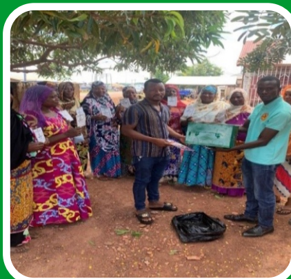
Plate 10.3: VSLA Group at Walwale

9 Disbursement of FIP Loans. FFID introduced an interest free loan scheme dubbed Financial Inclusion Program (FIP) to support the VSLAs. The objective of the fund is to increase access of petty traders and farmers to finance in order to improve productivity and business operations. Two VSLAs with 50 members (38 females and 12males) accessed loans to the tune of GHC 20,000. The loan recovery has so far been 100%.