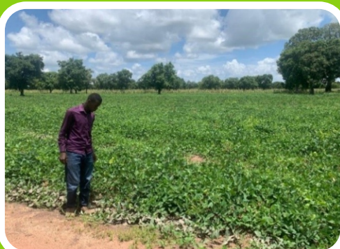
Plate: 1.9: Visit of FFID staff to selected farms at Zuo

The organisation conducted a number of monitoring visits to the farms of the beneficiaries to ascertain the performance of the crops and to give feedback. Majority of the farmers adopted good agronomic practices in their farms.