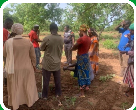
Plate 1.5: Training farmers on CA at Zoa