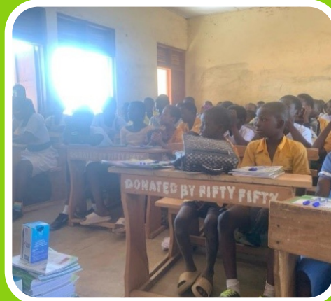
Plate 10.8: After FFID intervention at Yama R/C School