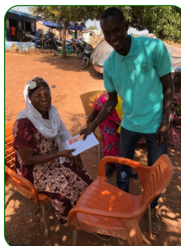
Plate 10.4 Presentation of FIP Funds to beneficiary at Walewale

9 Disbursement of FIP Loans. FFID introduced an interest free loan scheme dubbed Financial Inclusion Program (FIP) to support the VSLAs. The objective of the fund is to increase access of petty traders and farmers to finance in order to improve productivity and business operations. Two VSLAs with 50 members (38 females and 12males) accessed loans to the tune of GHC 20,000. The loan recovery has so far been 100%.