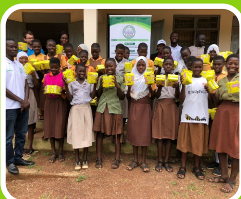
Plate 10.14: Distribution of Sanitary pad to students at Zugu DA JHS

After the training of FFID staff, they embarked on sensitization sessions on mensural hygiene management in the West mamprusi municipal (Walewale girls model school) and Kumbungu District (Zugu D/A JHS). Mensural hygiene commodities were distributed to the students after every sensitization session.