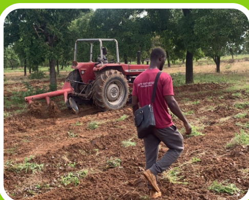
Plate 1.7 Ploughing on-going at Zua

increase in crop yields by the target beneficiaries.