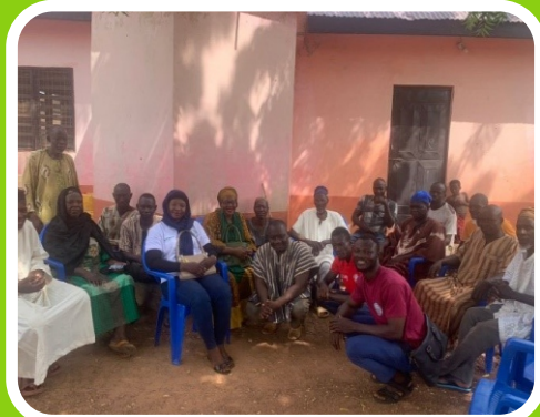
Plate 1.4: Meeting with stakeholders at Zugu