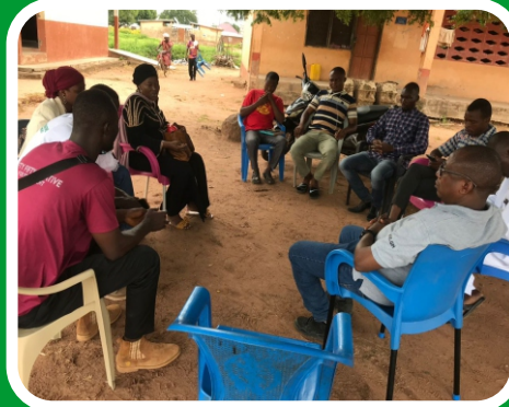
Plate: 10.6: Meeting of VVF RPD, FFID staff and Teachers of Yama RC School