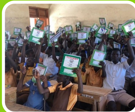
Plate10.10: Distribution of teaching and learning materials to learners at Yama