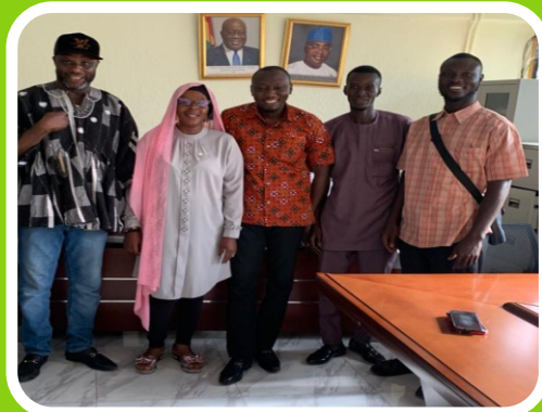
Plate 1.1: Staff of FFID with staff from Ministry of Health

2 Community Entry and Needs Assessments: Following the support from the Vibrant Village Foundation, FFID expanded its interventions to many more communities in the West Mamprusi, Sagnarigu and Kumbungu Districts including Zua, Yama, Zugu, Kparigu Boamaasa, Walewale, Katariga and Sagnarigu. Community needs assessments was subsequently conducted which shaped FFID interventions and support to communities in the area of Agriculture, Education, Protection and Health. In all the communities visited, the people expressed their preparedness to