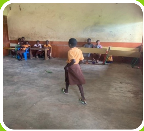
Plate 10.7: Before FFID Intervention at Yama RC School