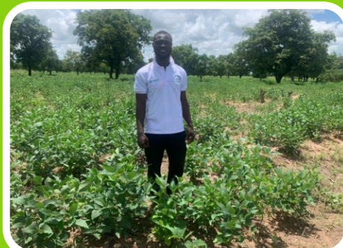
Plate: 1.10: Visit of FFID staff to selected farms at Zuo