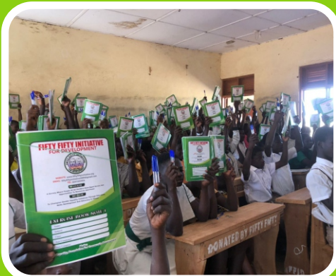
Plate10.9: Distribution of teaching and learning materials to learners at Yama

At least 326 students comprising of 219 girls and 107 boys were given exercise books and pens to help them in their learning. The support was in response to the call made by teachers and parents on the need to support the students with these essential teaching and learning materials.