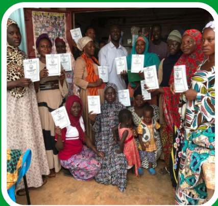
Plate 10.2: VSLA Group at Katariga

share-out of the groups will be done in the next fiscal year.