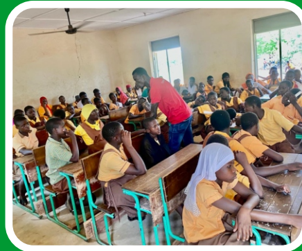
Plate10.11 Program Coordinator sensitizing students of Zugu on Girl Child Education

14 Staff Capacity Building on VSLAs and Mensural Hygiene: Two days training was organized for staff of FFID on Mensural hygiene with the goal of equipping them with the appropriate knowledge and skills to cascade the training of teenage girls in the operational communities. The training was facilitated by a staff of Songtaba (Bala Hairiya)