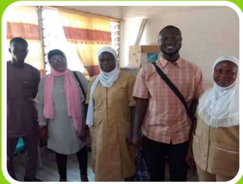
Plate 1.2: FFID staff with MCE and Coordinator